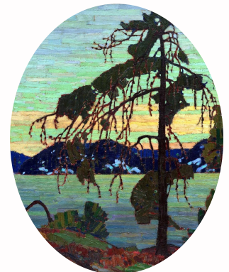
"The Jack Pine" by Tom Thompson