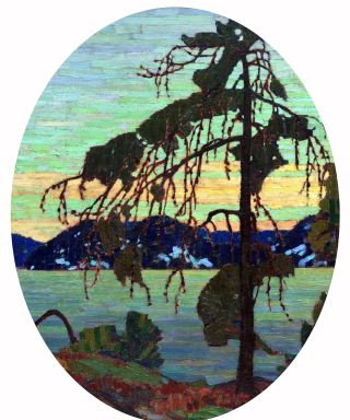
"The Jack Pine" by Tom Thompson